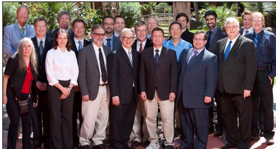
Libertarian National Committee officers and representatives met in Phoenix, Ariz., March 28–29.

The LNC created an advisory Ballot Access Committee to supplement the hard work of our regular activists. The committee's key tasks are to collect, analyze, and report information, but the LNC still retains decision mak-