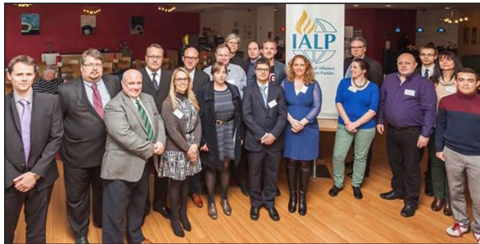
Representatives of Libertarian Parties from the United States, the United Kingdom, Belgium, France, Germany, Spain, Switzerland, the Czech Republic, The Netherlands, and Poland met in Bournemouth, UK, for the founding of IALP.